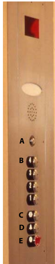
Figure 1: 4 Stop COP

The COP emergency light remains ON in the event of a main power failure. The emergency light uses a Battery Back-Up system with an automatic recharger.