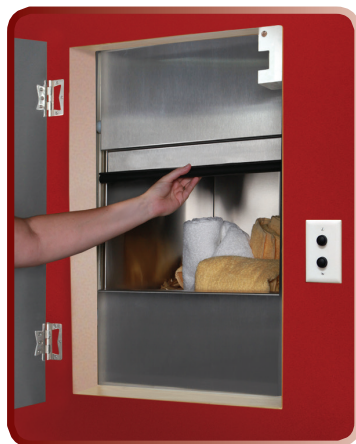
Shown in optional Stainless Steel finish