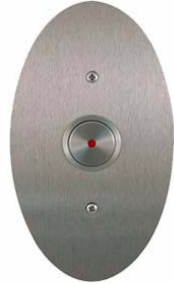
Figure 3: Hall Call

In the event of a building power failure, the system is provided with a temporary power back-up system to allow the elevator to run down to the next available landing, or to the first floor landing. On resuming normal building power, the back-up system will turn OFF and begin automatic recharging.