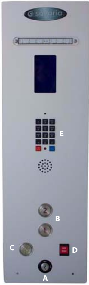
Figure 1: Sample COP